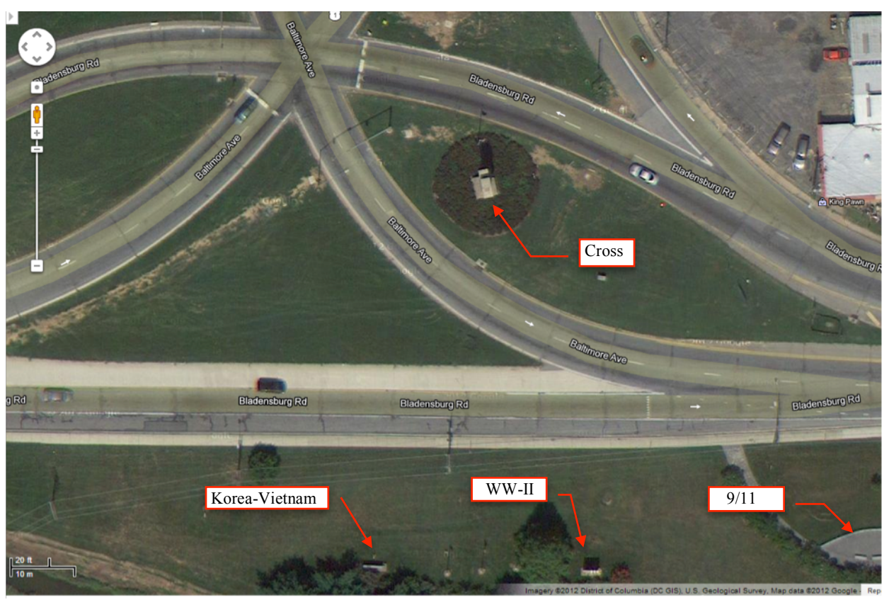
Google Maps image taken of the Property (labels added)